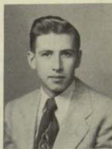
BOB BAGDONS Photographer