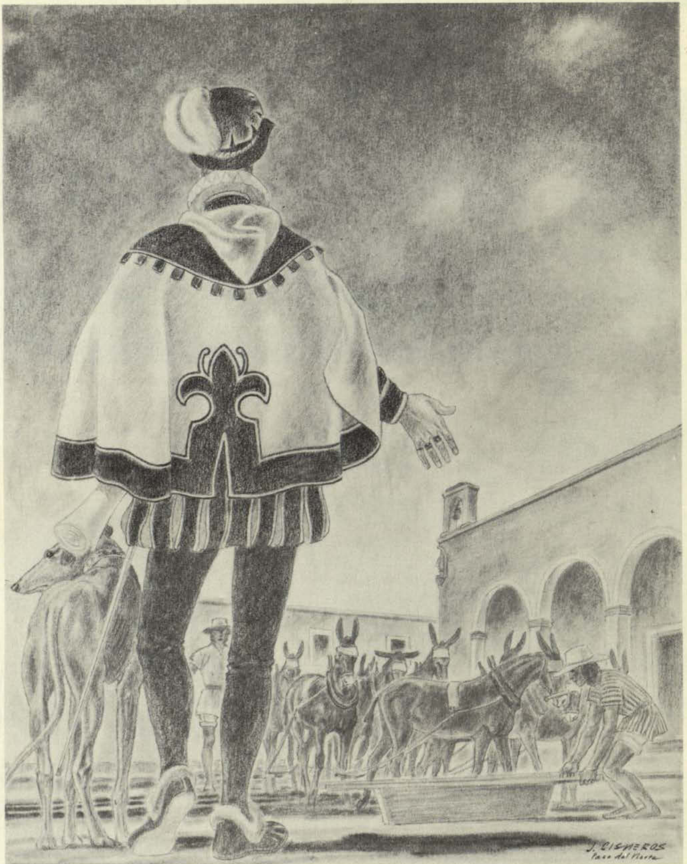
Spanish System of Metallurgy