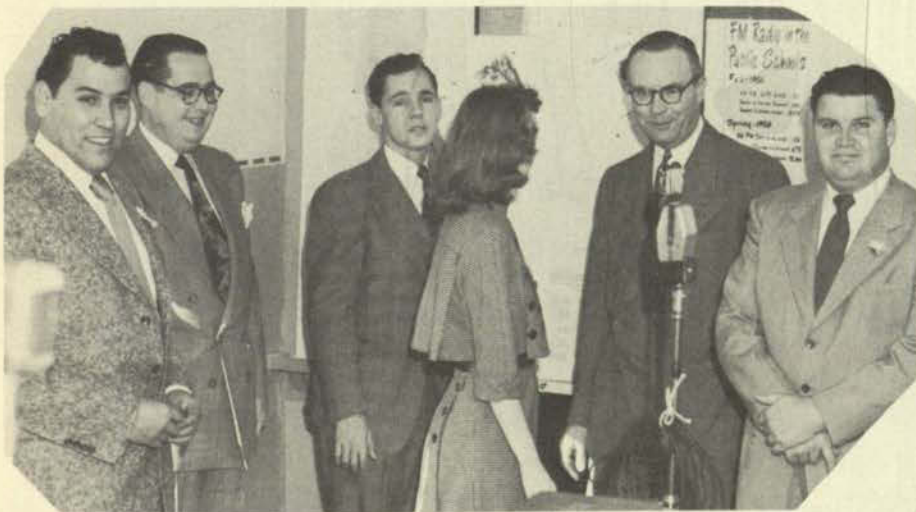
Distinguished visitors at the Open House of Station KVOF-FM.