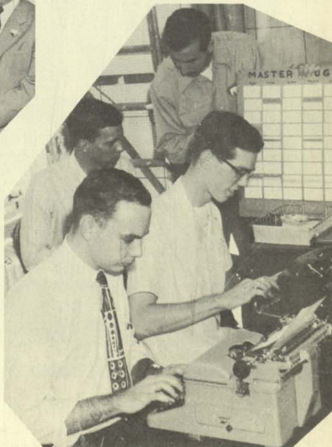
On the creative side of Radio are the Continuity Writers and Program Director.