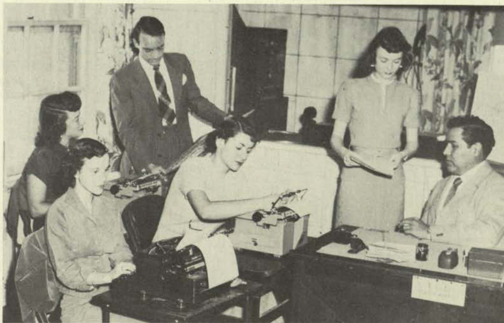
The daily routine of the Traffic Department at the Radio Station.