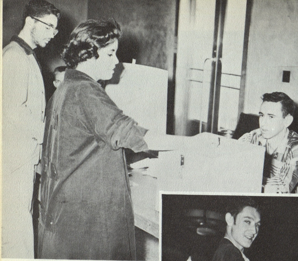
A constitutional revision was voted in by the student body as suggested by the Student Council.