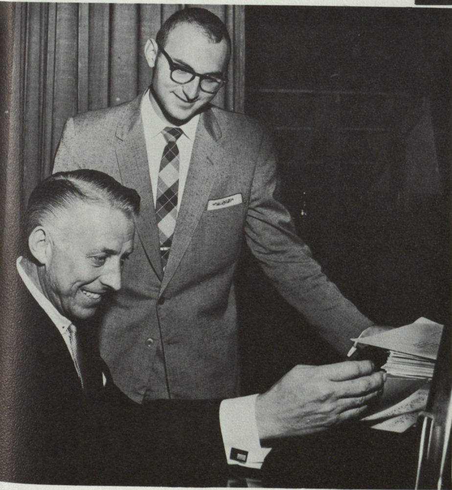
"All those opposed say Achtung!"