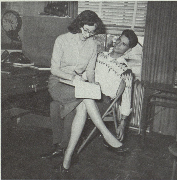
"Take a letter . . . ."