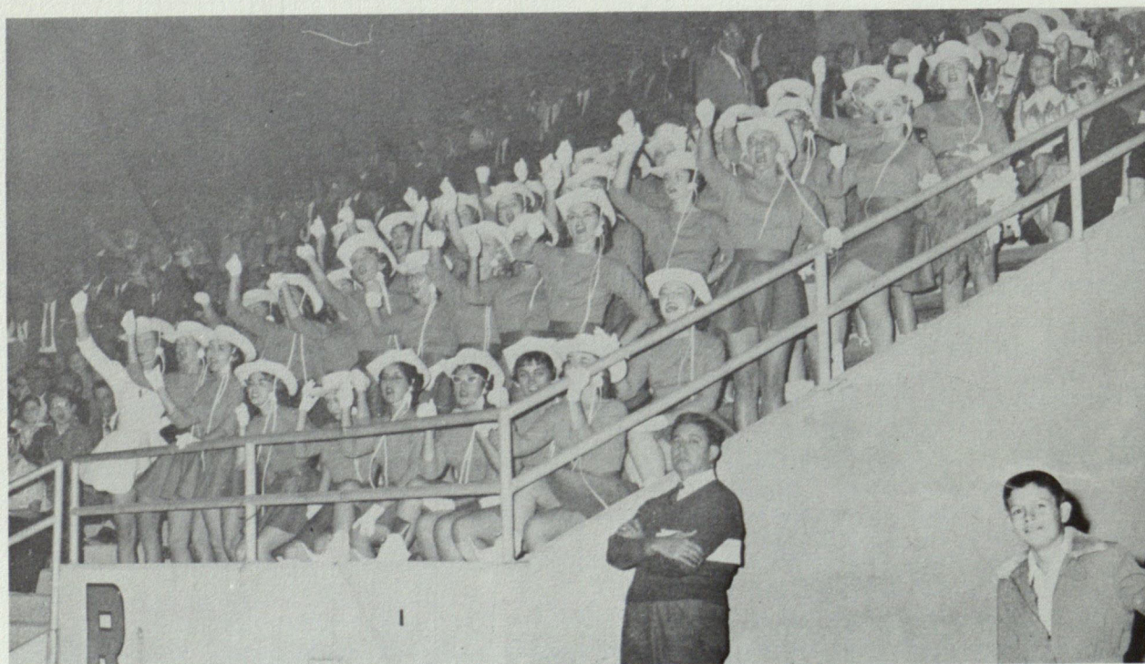
The lovely Golddiggers shout encouragement as the Miners near the goal line.