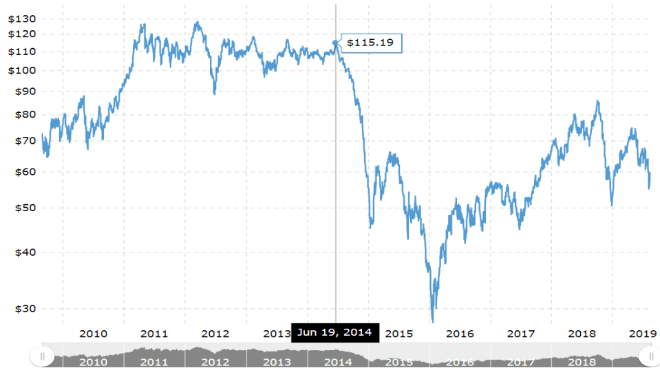
Figure 2.1: State of Oil Prices Since 2010

It may also be a credible theory as the U.S. has been boosting its production of oil and liquid natural gas (LNG), which also threatens Russian oil for Europe's energy demands. In his 2019 State of the Union Address, President Trump declared, "The United States is now the number-one producer of oil and natural gas anywhere in the world." 107 Currently, LNG is priced at $6.20 per million British thermal units and the United States is producing 2,562 trillion cubic feet of natural gas to meet energy needs. 108 109 There are currently LNG import stations in 12 EU countries, including Poland and Lithuania, which offer direct threats to Russian oil pipelines racing to meet Europe's energy demands. 110