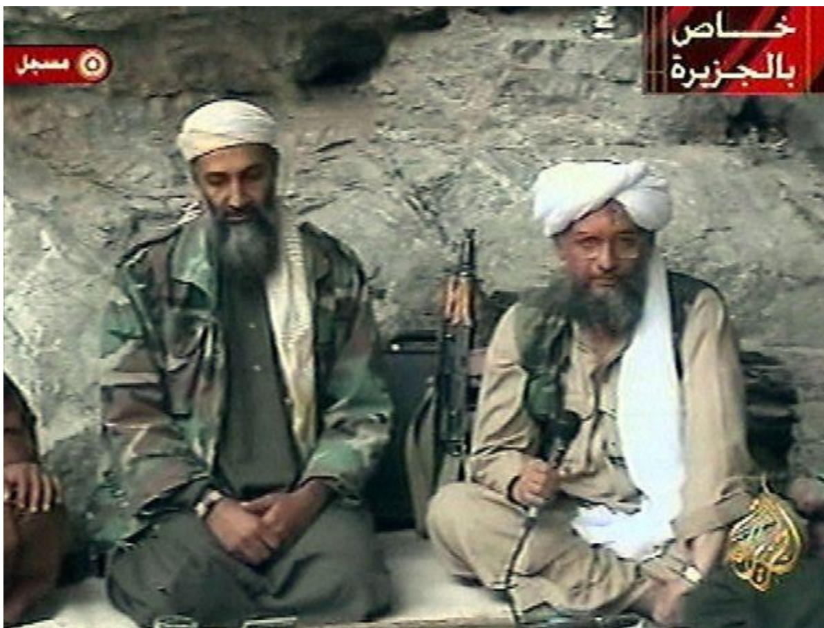
Figure 5: Osama bin Laden and al Zawahri Appearance 73

In figure 5, there are a number of symbols that need to be discussed. Some examples of symbols found in this figure include the AK-47, the colors (white and black), the natural background, and the military fatigues. All have specific meanings that are designed to show both bin Laden and al-Zawahiri in a positive light. The weapon and fatigues are used to symbolize jihad and the mujahedeen, the white is used to symbolize purity and piety, and the black as mentioned before is the color of jihad. Another symbol that should be considered is the cave acting as a natural background. This could be interpreted as both bin Laden and al-Zawahiri are in the “trenches” (so to speak) and are fighting for the cause at the front lines. A parallel to this is