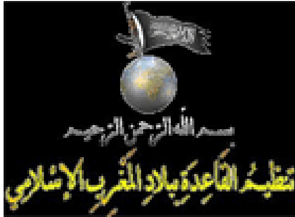
Figure 4: al Qaeda in the Islamic Maghreb (AQIM). 72

In figure 4 the color black again, use of the globe with the focus on Africa to represent the Maghreb. It also contains an AK-47 with a black banner on it.