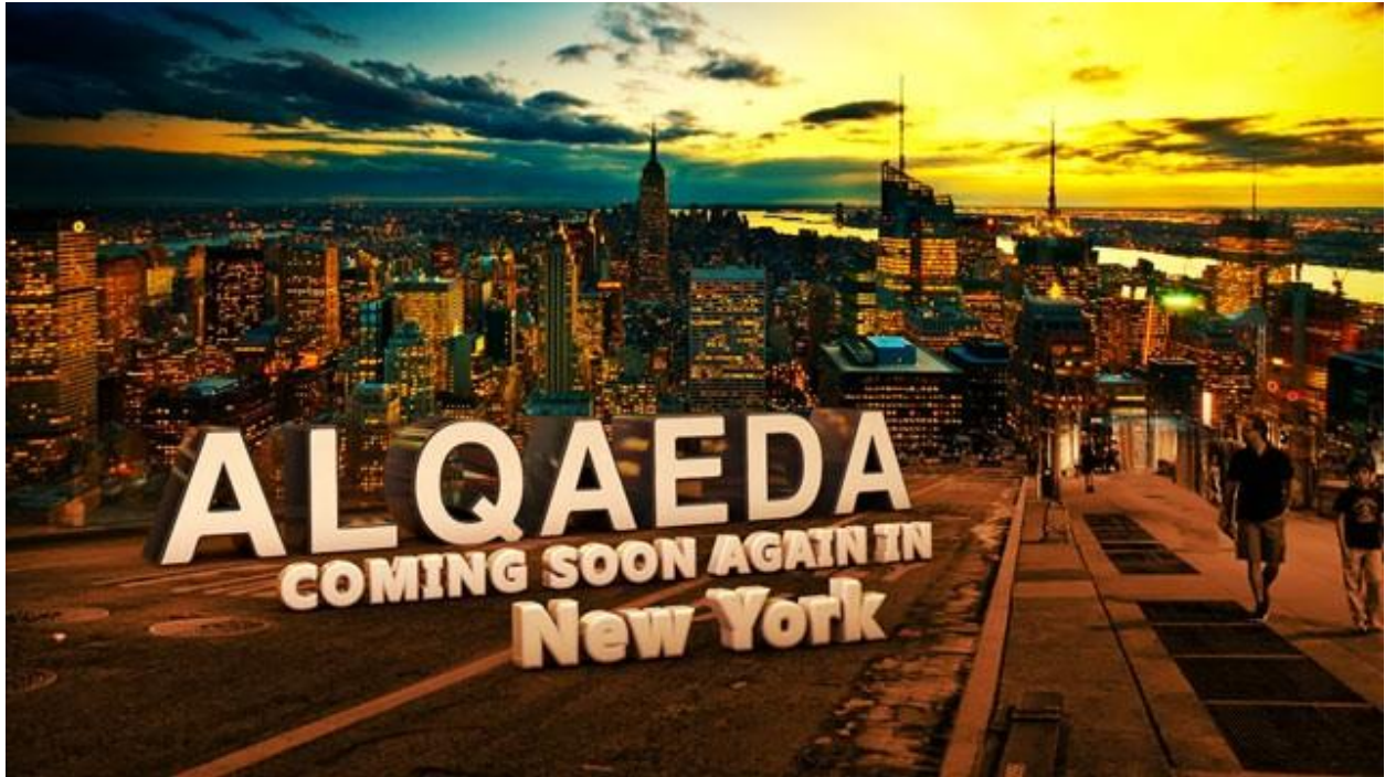
Figure 1: Al Qaeda coming soon again in New York 35

propaganda that al Qaeda supporters used to target New York City.