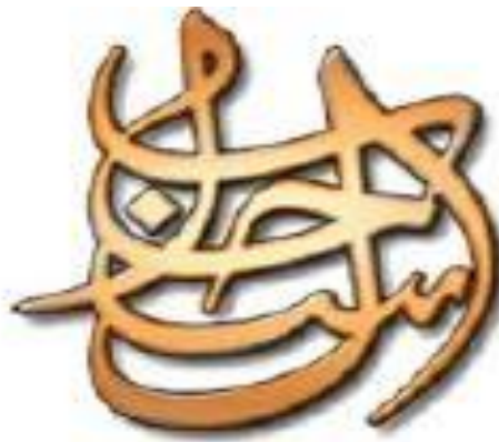
Figure 6: As-Sahab logo 74

when leaders of nations wear specific attire to project a message. An American example was when President Bush wore a flight suit in the Persian Gulf, which helped portray his role as commander in chief. Another example comes from Vladimir Putin who was photographed bare chested riding a horse; the image desired to show his strength and power. Referring to figure 6 the symbol represents al Qaeda's media arm, as-Sahab (which can be seen in the bottom right corner of figure 5). While it is simply a couple of words written in calligraphy, it too, has its historical meaning. Calligraphy has a long and traditional standing in Islamic culture and in its own right is a form of artwork. Pictured below is an enlarged figure of the symbol.