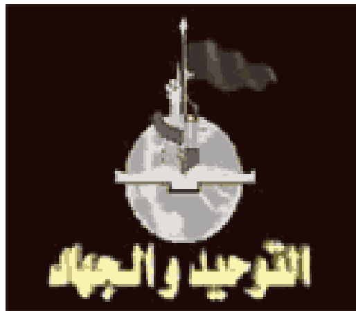
Figure 3: al Qaeda in Iraq/ al Qaeda in Mesopotamia (AQI). 71

When exploring al Qaeda's propaganda operations there are a few reoccurring themes and trends that start to appear. Al Qaeda uses symbols in many of its propaganda productions. Some symbols commonly found throughout al Qaeda propaganda is the use of the Koran and certain colors. In particular the color black which is commonly associated with jihad. Another common symbol is weapons (in particular the AK-47). The following are different examples of al Qaeda central and its affiliates' use of symbols.