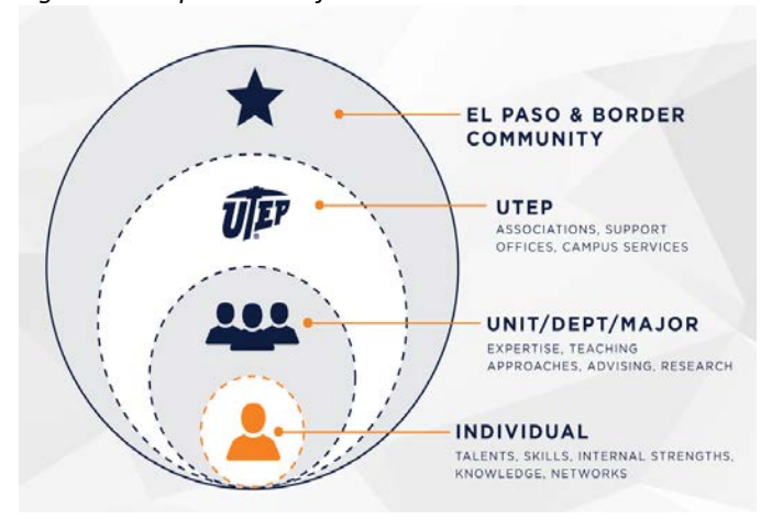
Figure 1. Sample model of individual and collective assets.

Asset-based Teaching and Learning (ABTL) recognizes the strengths, skills, and resources of learners, using them as a starting point for learning. This approach toward pedagogy can take place within the classroom (a site of explicit teaching and learning) or within any space where explicit or implicit teaching and learning takes place (such as the workplace). For the purposes of this paper, the focus is on asset-based approaches to pedagogy within postsecondary classrooms. Asset-based Teaching and Learning is defined by five distinct characteristics which represent an outgrowth of the educational research and learning theory that underpin it. Figure 2 below provides a visual representation of these characteristics, which include: