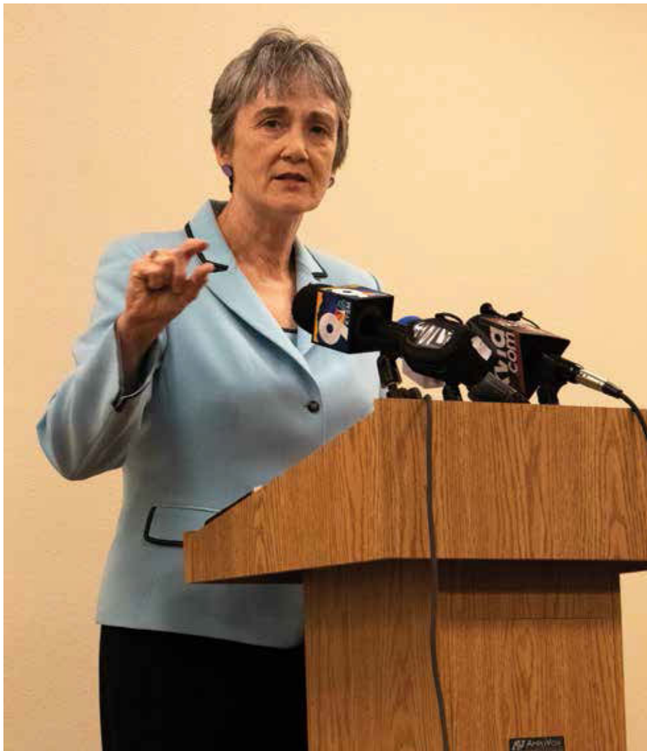
Dr. Heather Wilson, sole finalist for the position of UTEP president made her first appearance on campus Monday, March 11.