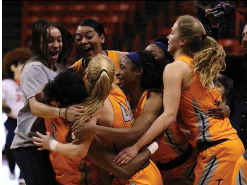
UTEP women's basketball takes on Marshall in the first round of the Conference-USA tournament March. 13.