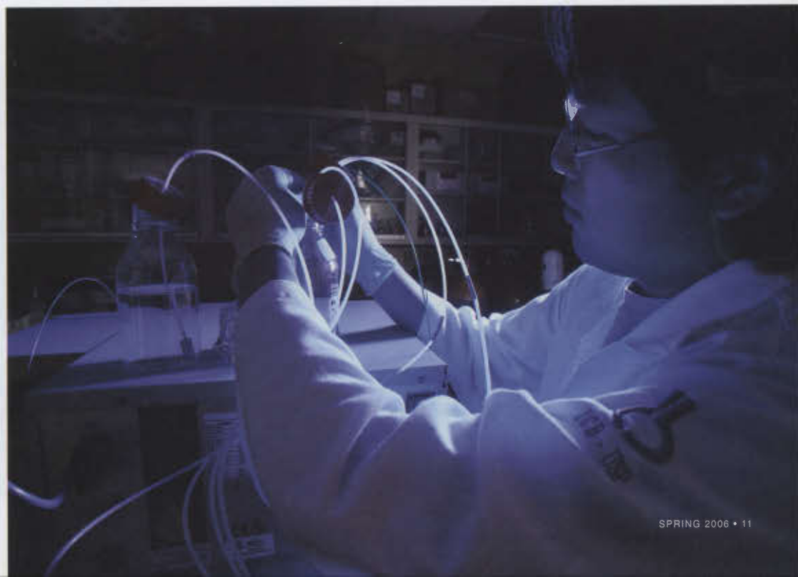
From classroom to laboratory, UTEP delivers the tools for its students' success.

"You can't say 'we've arrived' and take a break," she says. "We have to continue to be hungry, to be competitive, to continue to want the most for the students on this campus whose talent makes them very deserving of everything we can do." ■