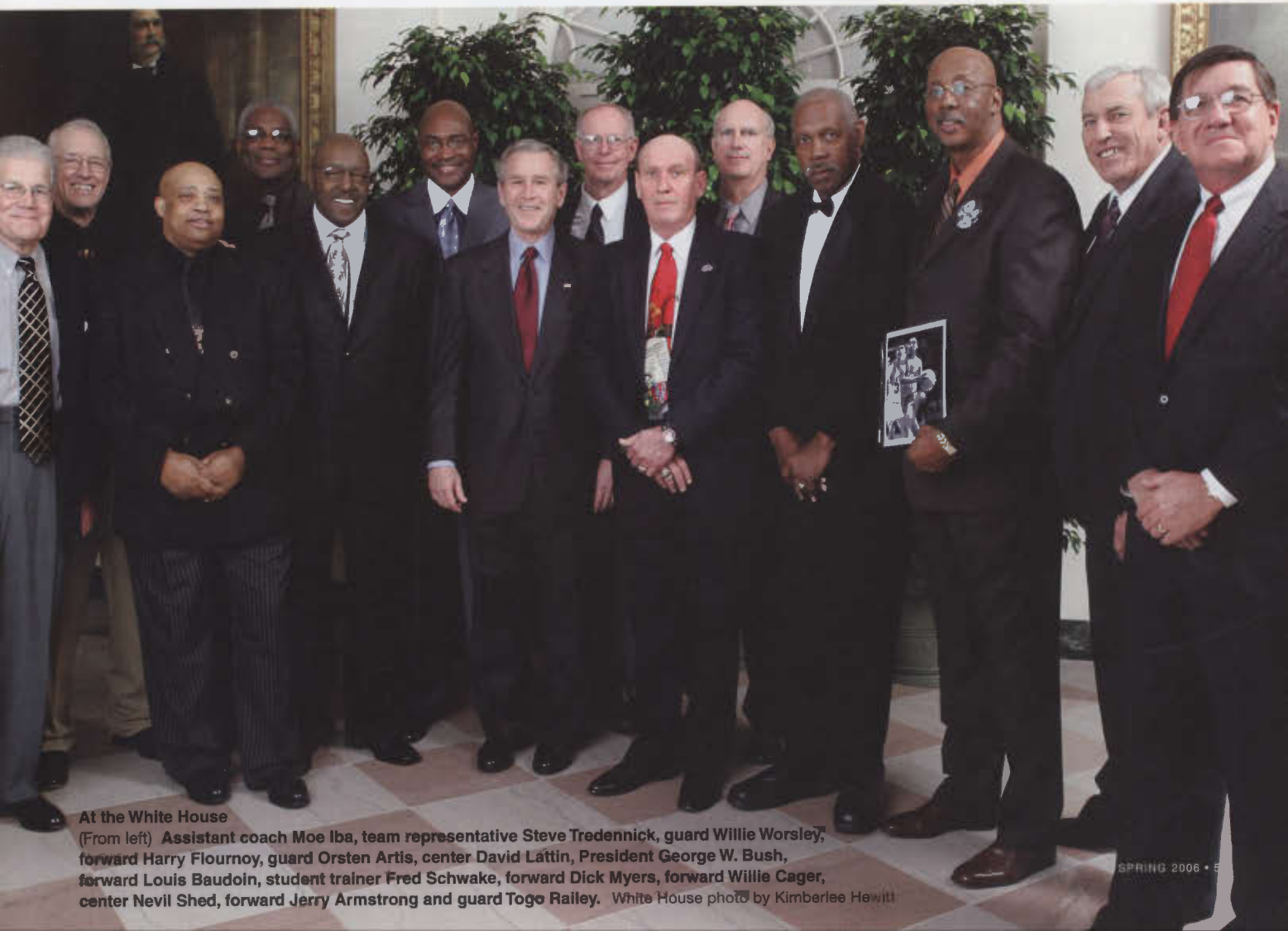
At the White House