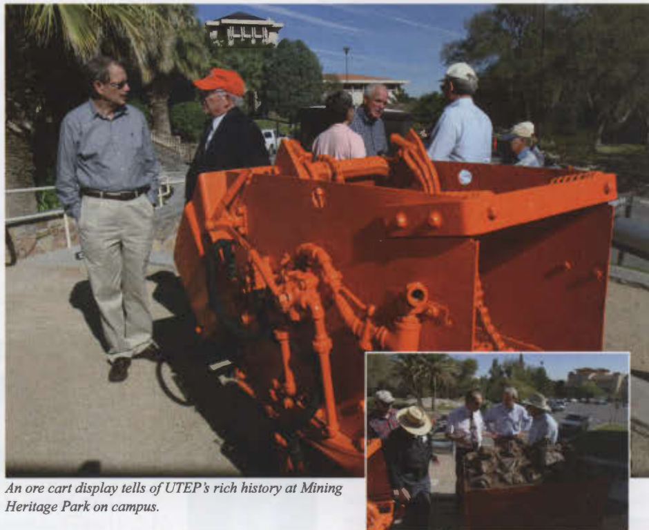
An ore cart display tells of UTEP's rich history at Mining Heritage Park on campus.