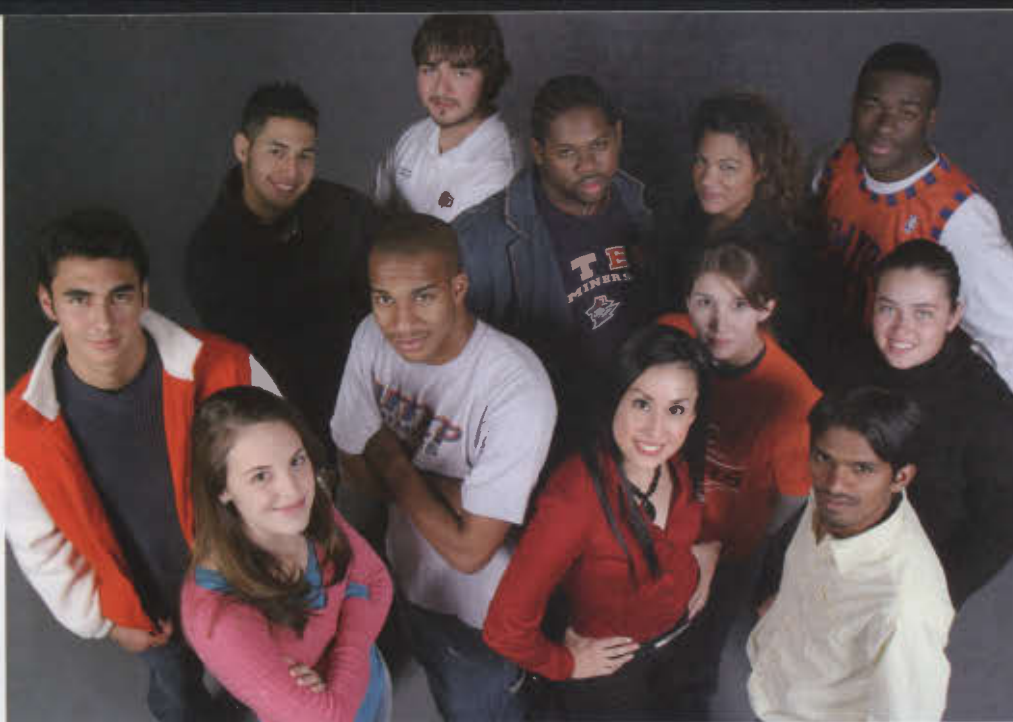
UTEP is a leader in delivering educational opportunities to a diverse community of students.

competitiveness and annual fund development, the university also stays true to its mission of meeting the educational needs of a growing region.