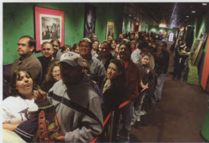
Hundreds of Miner fans lined up to see the debut of "Glory Road" in El Paso.