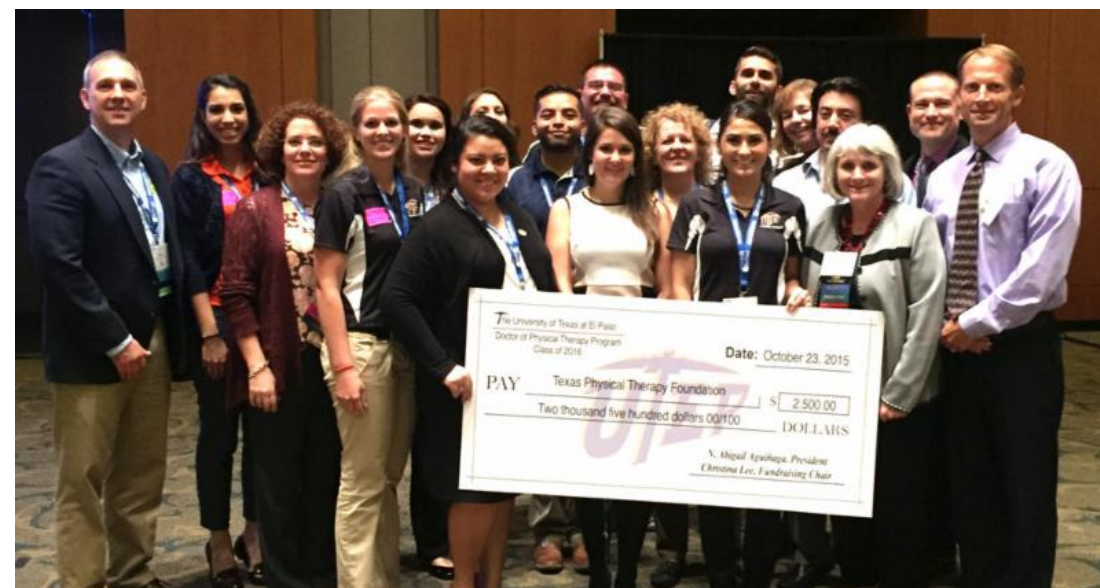
UTEP DPT Program students and faculty_ along with other Texas Physical Therapy Association members_ pose with the check presented by the DPT Class of 2016 to the Texas Physical Therapy Foundation to support physical therapy research in Texas.

Following the tradition of previous UTEP Doctor of Physical Therapy (DPT) cohorts, the DPT Class of 2016 made a large donation to the Texas Physical Therapy Foundation (TPTF). The TPTF provides grants to support physical therapy research in Texas. Class officers presented a $2500 check at the Texas Physical Therapy Association's Annual Conference on October 23, 2016, earning a standing ovation from the crowd. Demonstrating their support for physical therapy research in Texas, UTEP DPT students have donated over $11,000 since the first DPT cohort (Class of 2012) began these fundraising efforts. The UTEP DPT Program is the largest TPTF contributor among all DPT programs in Texas.