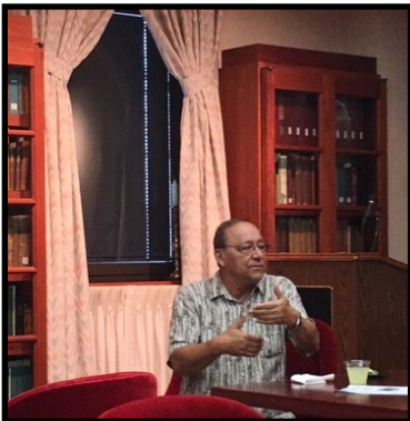
Playwright Carlos Morton in Special Collections, April 5.

On April 5 Special Collections hosted a well-attended panel discussion about Carlos Morton's play The Many Deaths of Danny Rosales . The play was based on a real-life police brutality case in Central Texas during the late 1970s.