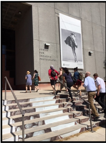
Touring the Center for Creative Photography in Tucson.