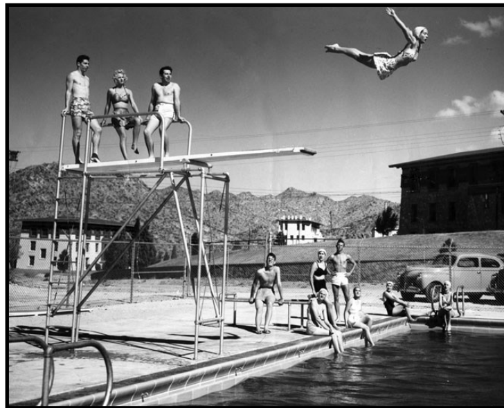
Old UTEP swimming pool, circa late 1940s.

The Library sits on a hill within sight of the Mexican border. Our unique position informs our attitudes and the services we offer. We aim for excellence in serving our users and in making our collections accessible.