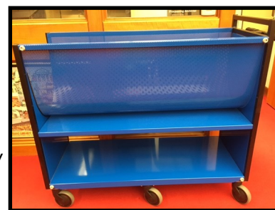
New concave map truck

As always, we are extremely grateful for our generous donors!