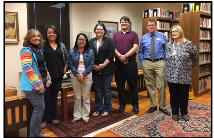
NMSU SpC staff visit UTEP SpC, March 2017.