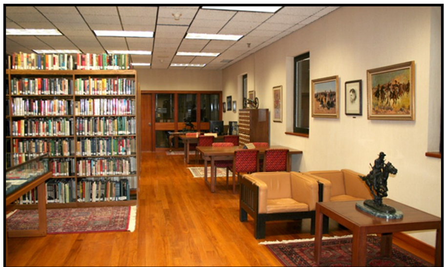
S.L.A. Marshall Military History Room

The Library sits on a hill within sight of the Mexican border. Our unique position informs our attitudes and the services we offer. We aim for excellence in serving our users and in making our collections accessible.