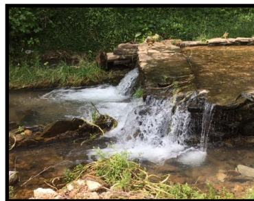
Withrow Springs, Arkansas