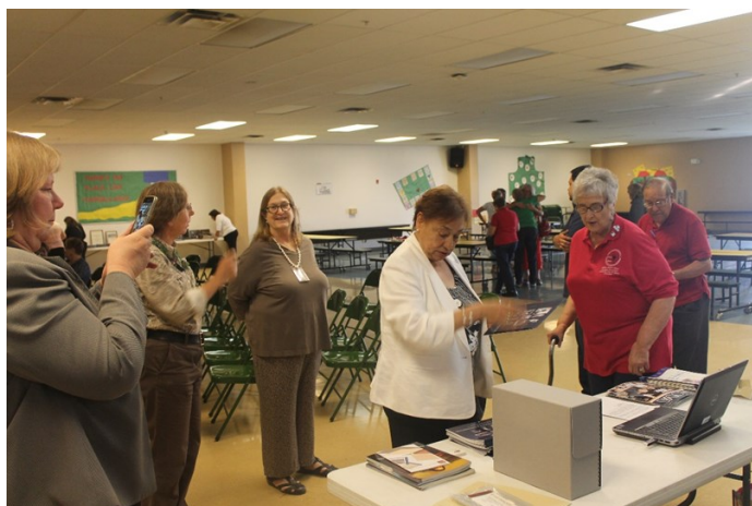
Special Collections table at Cadwallader School, May 12, 2016