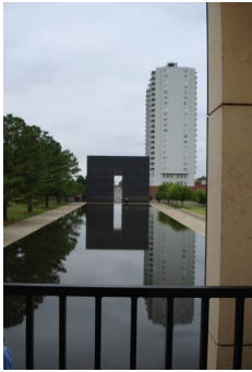
Oklahoma City Memorial and Museum repository tour.