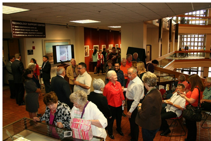
ASARCO in El Paso exhibit opening, April 8, 2016

During the past year and a half, Special Collections finding aids and presentations accessed via the Library's Digital Commons institutional repository were downloaded over a hundred times in the United States. Many international researchers in China, Sweden, Germany, France, Russia, Ireland,