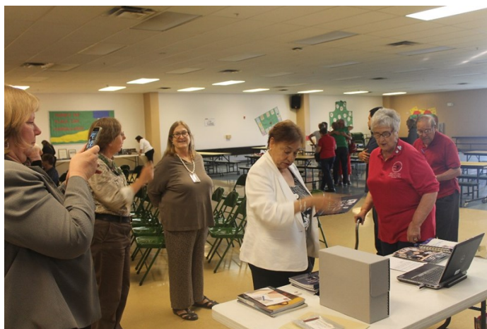
Special Collections table at Cadwallader School, May 12, 2016