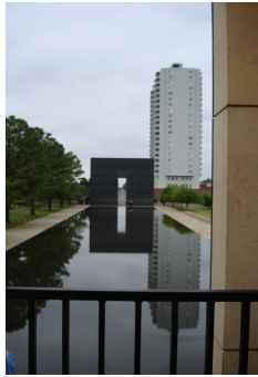
Oklahoma City Memorial and Museum repository tour.