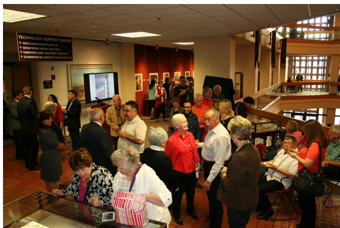
ASARCO in El Paso exhibit opening, April 8, 2016

During the past year and a half, Special Collections finding aids and presentations accessed via the Library's Digital Commons institutional repository were downloaded over a hundred times in the United States. Many international researchers in China, Sweden, Germany, France, Russia, Ireland,