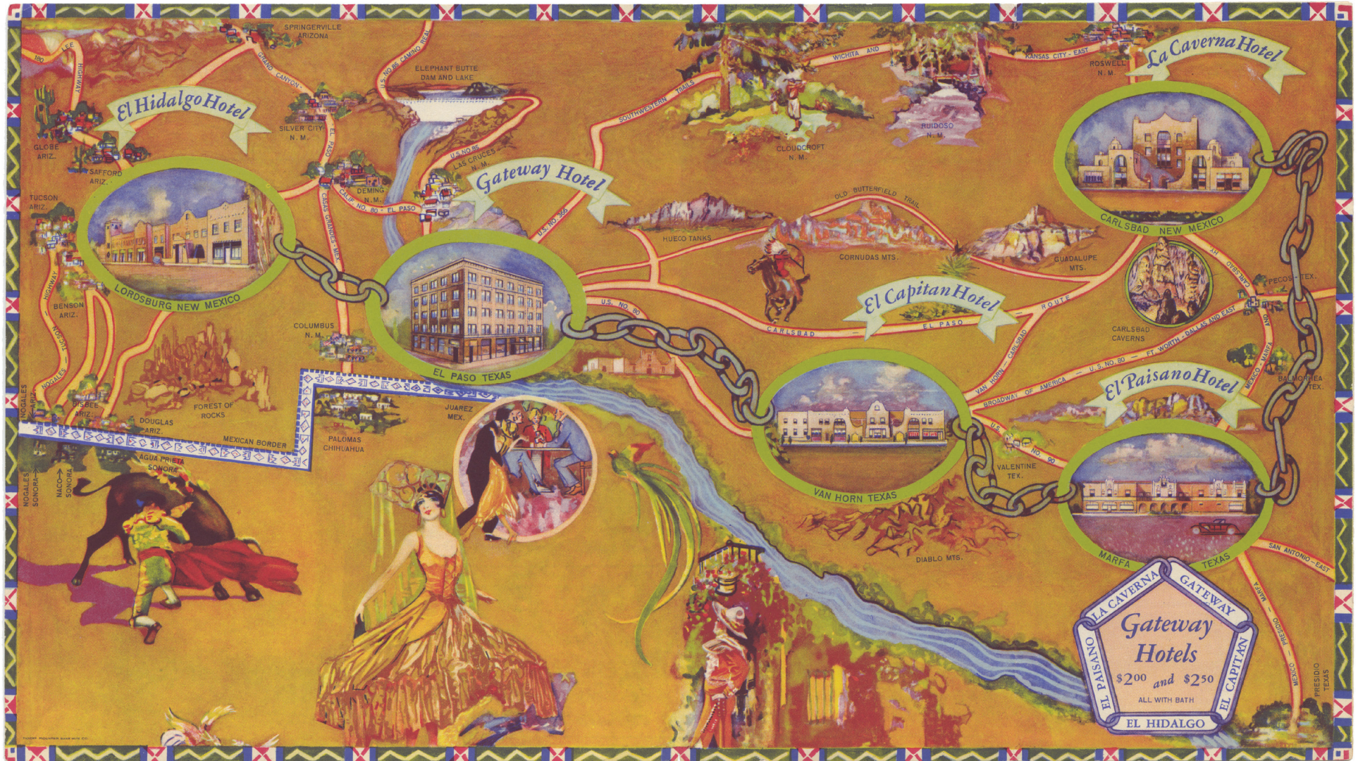
Gateway Hotels brochure

“Gateway Hotels: Strategically Located to Serve Your Needs in the Great Southwest,” promotional brochure from our Carl Hertzog book collection. This brochure features the Gateway Hotel, El Capitan Hotel, El Hidalgo Hotel, El Paisano Hotel, and La Caverna Hotel, and includes images of hotel coffee shops, rooms, and lobbies.