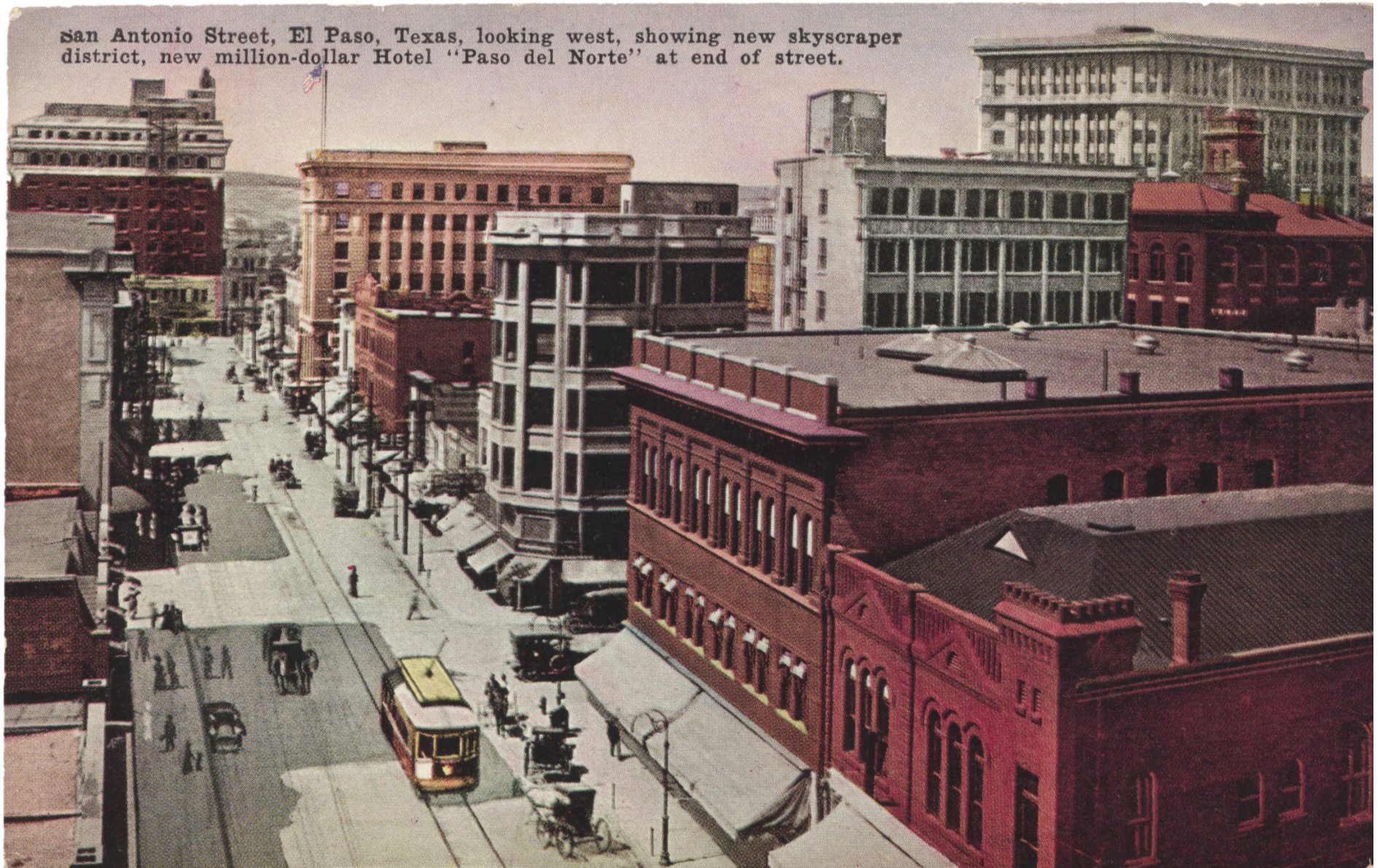
Haskell Monroe postcard collection, PH088

This postcard shows San Antonio Street and the new Hotel Paso del Norte. The hotel opened on Thanksgiving Day 1912 and was designed by the Trost and Trost architectural firm.