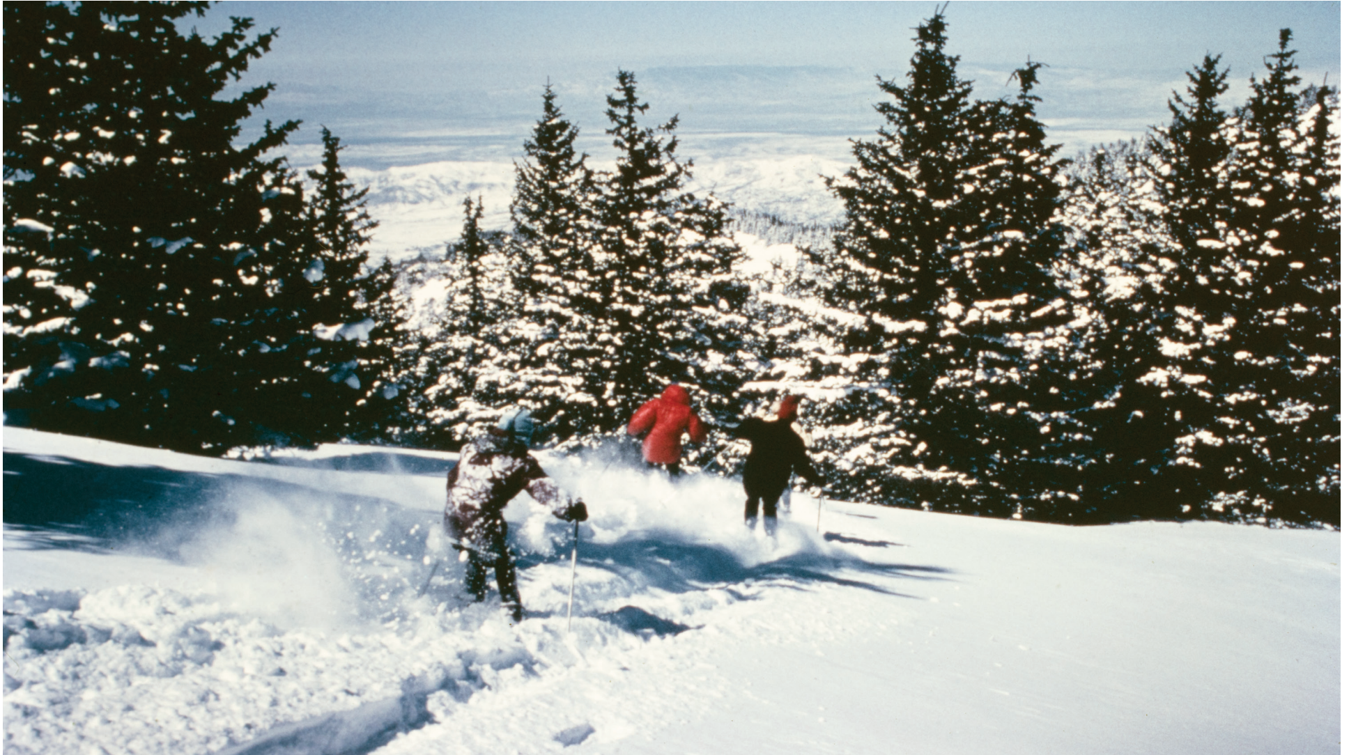
Meston Travel slide collection, PH050