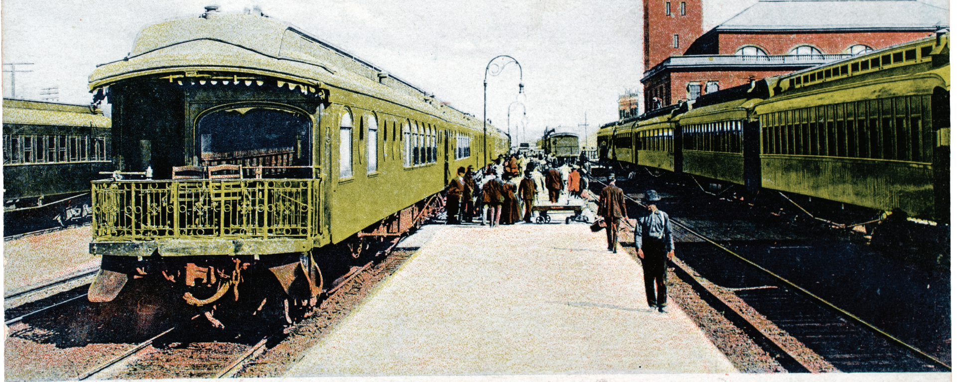
The Golden State Limited and the Union Station, El Paso, Texas