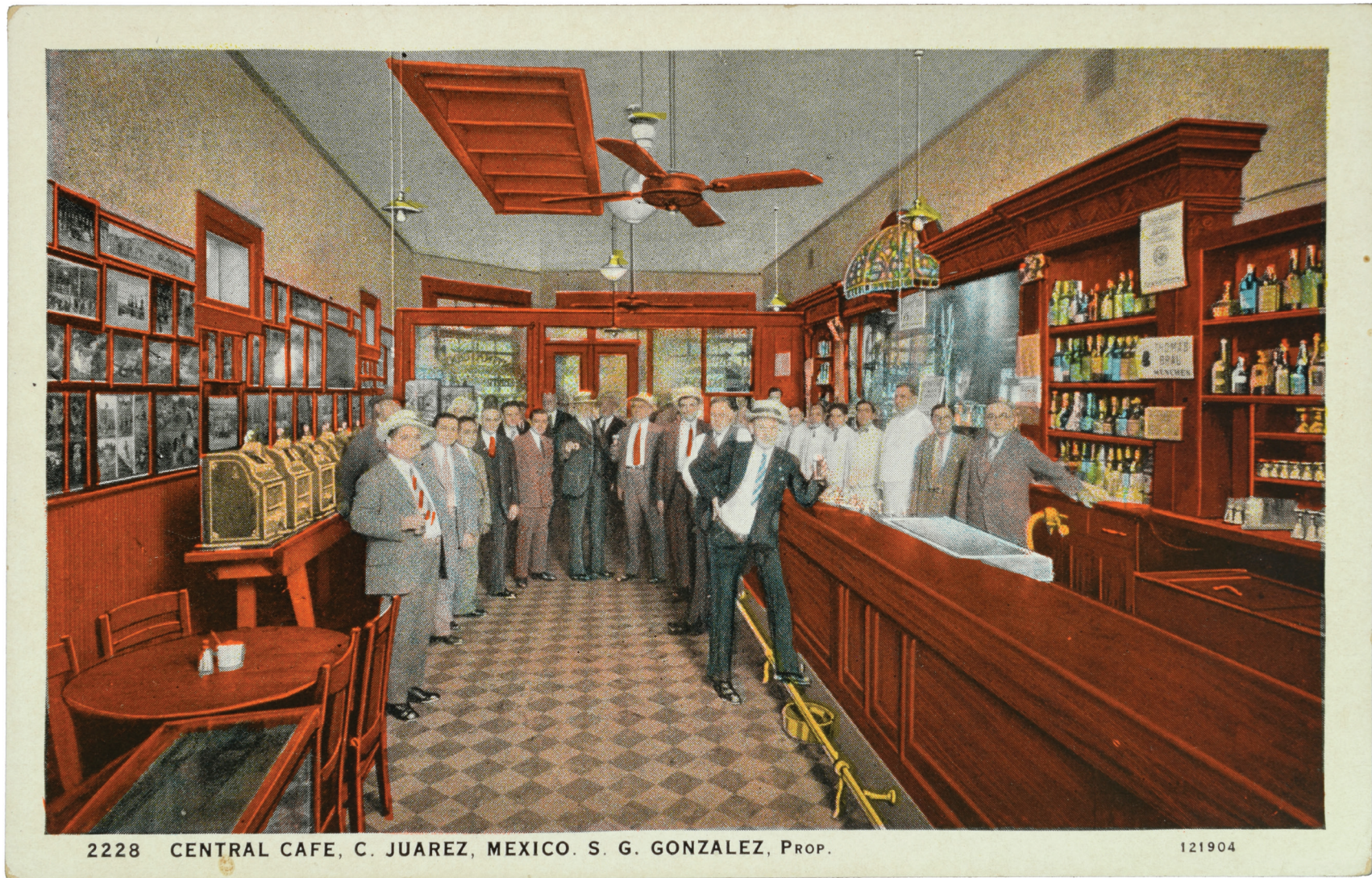
Central Café, Juárez, Mexico, Gertrude Fitzgerald photograph collection, PH025

The Gertrude Fitzgerald photograph collection consists primarily of photographs taken by Gertrude Fitzgerald of her family life and people and places related to the travel and work of her husband. The collection also contains postcards. These images date from the early twentieth century.