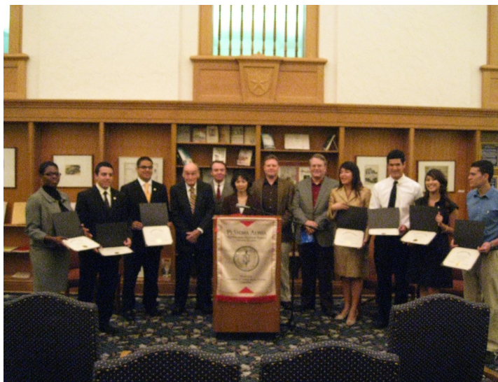
Students and Faculty at the 2009 Pi Sigma Alpha Induction Ceremony