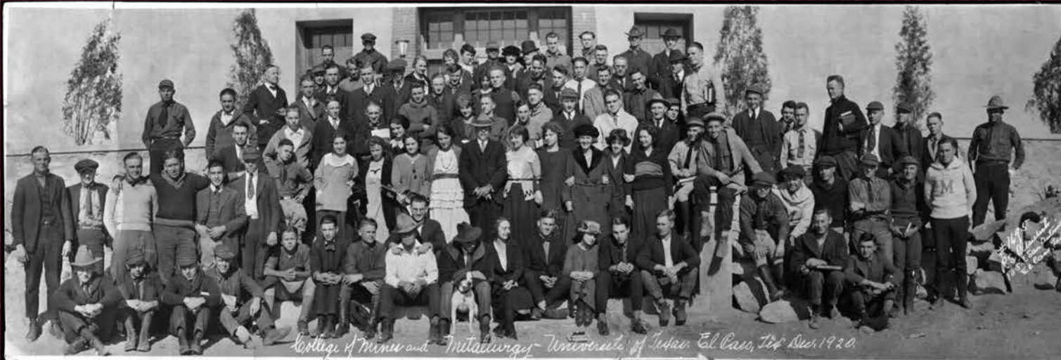
The faculty, staff, and students (plus canine friend) of the Texas School of Mines and Metallurgy, precursor to today's University of Texas at El Paso, 1920