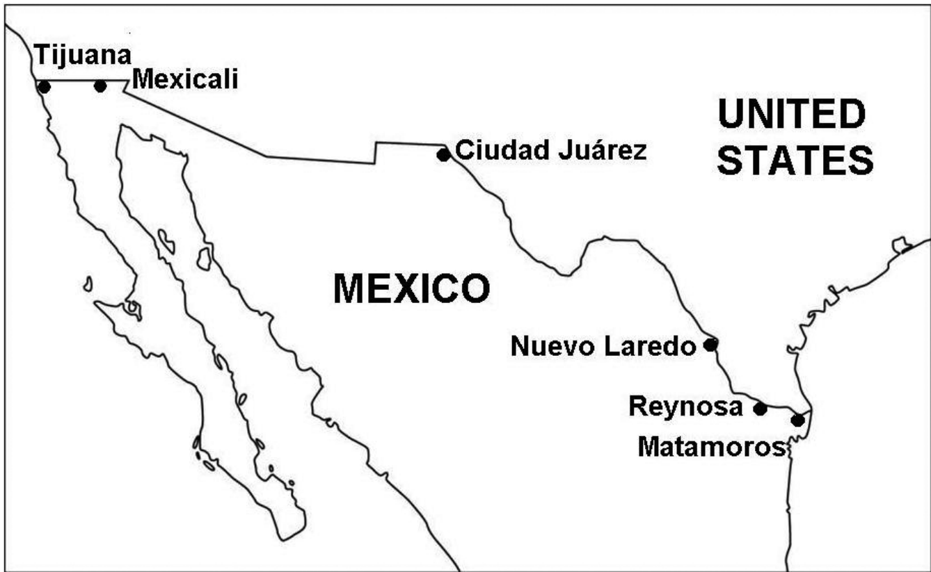
Fig. 1 Map of Major Northern Mexico Border Cities included in Sample

The government statistics agency in Mexico, INEGI, does not issue information to the general public on the monetary value of retail sales, but it does publish monthly-frequency real retail sales indices based on 2003 prices (INEGI 2012). The indices for each urban area are the dependent variables in this analysis. Although retail stores constituted 44 percent of all businesses in the six border cities studied in 2008, they had only 3.9 employees on average, compared with 10.2 workers per business across all economic sectors (INEGI 2009). Small businesses have traditionally dominated most sectors of Mexico's retail industry (Moreno-Pérez and Villalobos-Magaña 2010). While larger businesses may be able to partially insulate themselves from the risk of extortion by organized crime rings, this is more difficult for small businesses (EM 2011).